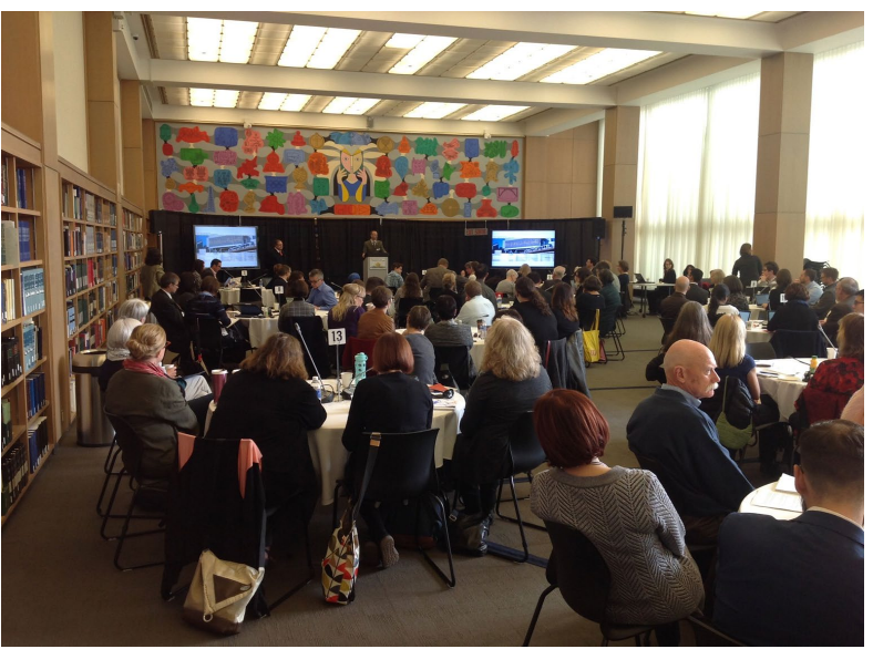
NHDS foundational assembly, Oct. 2016

Published resources: RightsStatements, file formats, best practices, survey results.