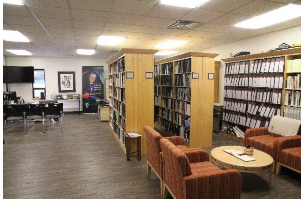
Visitor space in SRSC, including comfortable chairs and seating for groups.