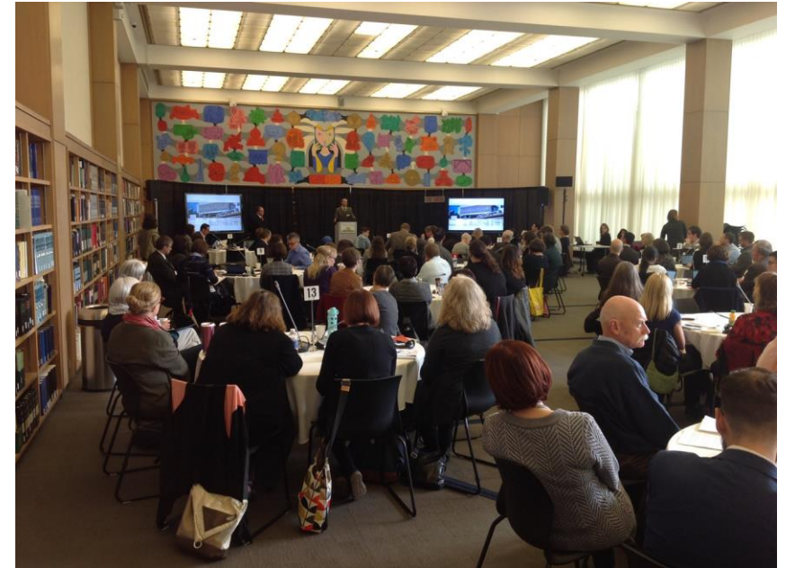
NHDS foundational assembly, Oct. 2016

To complement strategies already in place at Canadian memory institutions.