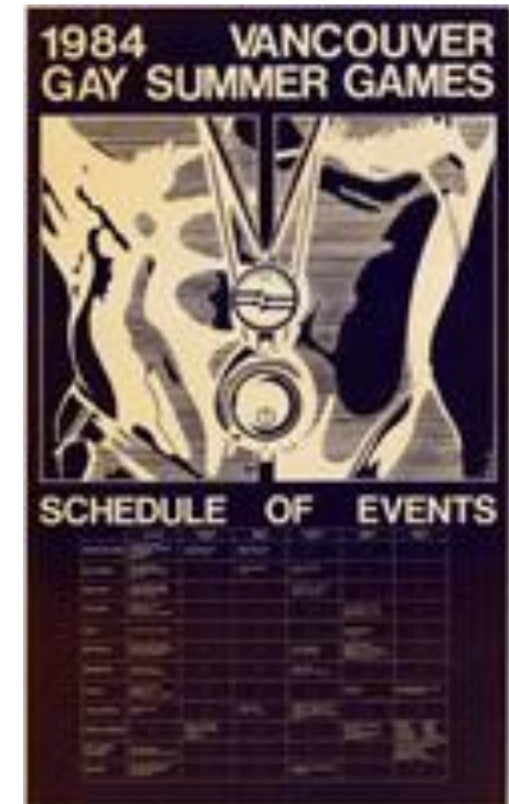
1984 Vancouver gay summer games : schedule of events, digitized by the BC Gay and Lesbian Archives, through NHDS funding