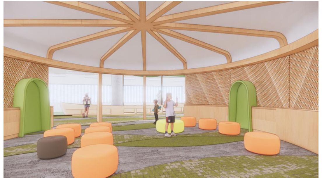
OPL-LAC Joint Facility, Indigenous Public Art