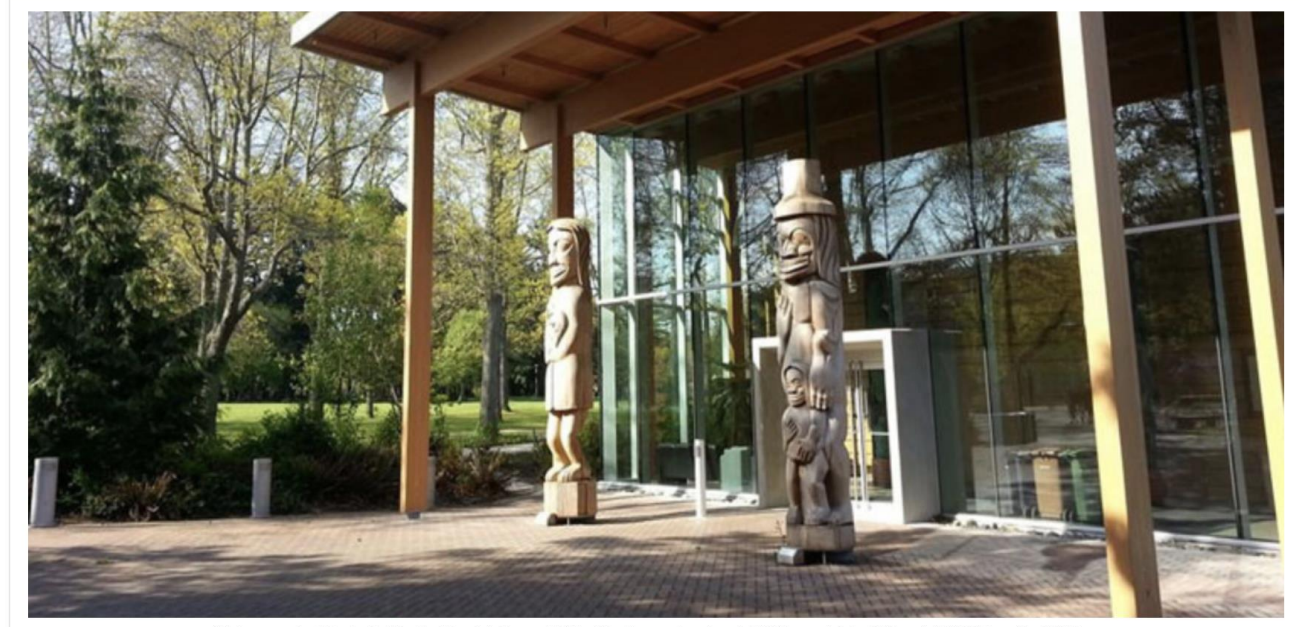
Welcome posts at the front of the First People's House at UVic, https://www.uvic.ca/assets2012/images/photos/billboards/2015/billboard-trc-2015.jpg