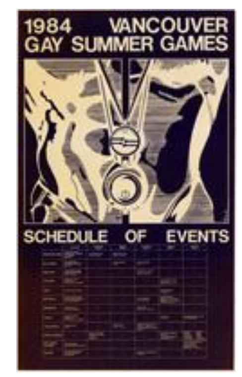
1984 Vancouver gay summer games : schedule of events, digitized by the BC Gay and Lesbian Archives, through NHDS funding