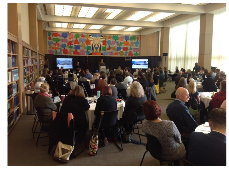
NHDS foundational assembly, Oct. 2016

To complement strategies already in place at Canadian memory institutions.