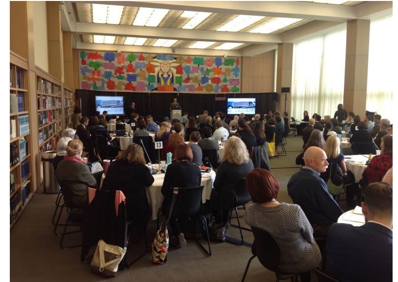
NHDS foundational assembly, Oct. 2016

Published resources: RightsStatements, file formats, best practices, survey results.