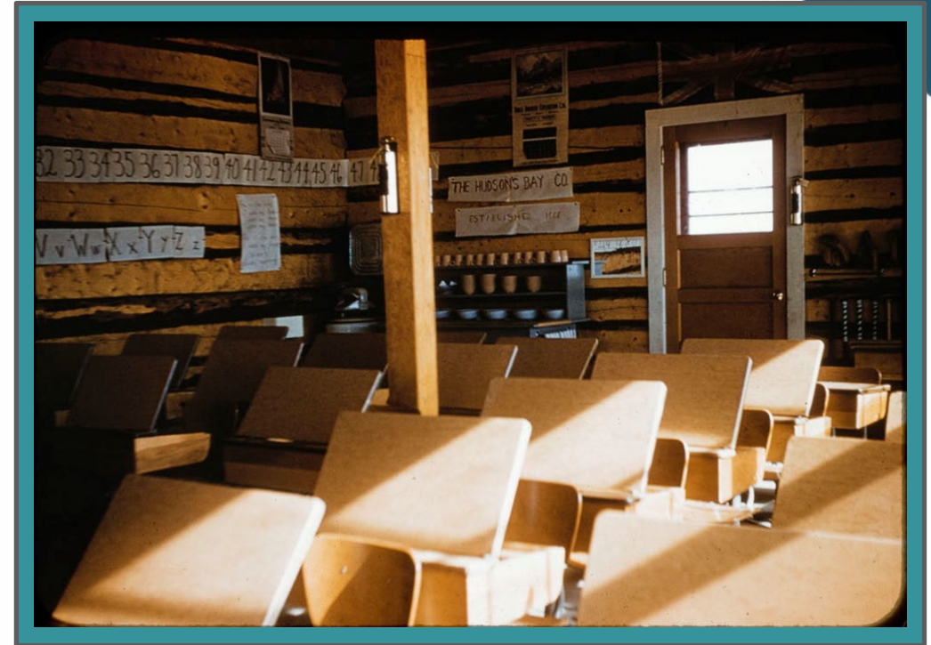
Whatì (formerly Lac La Martre) Day School, Northwest Territories, 1957