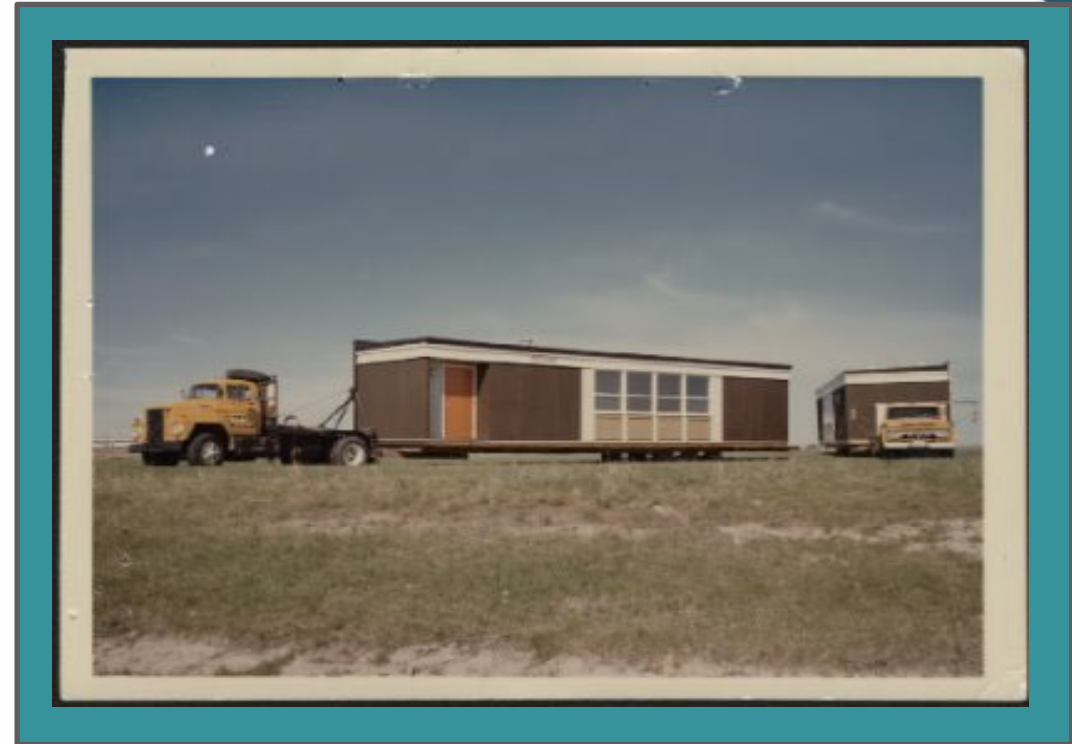
Prefabricated Day School being delivered to location, Forest, Ontario, ca. 1967, e011794878