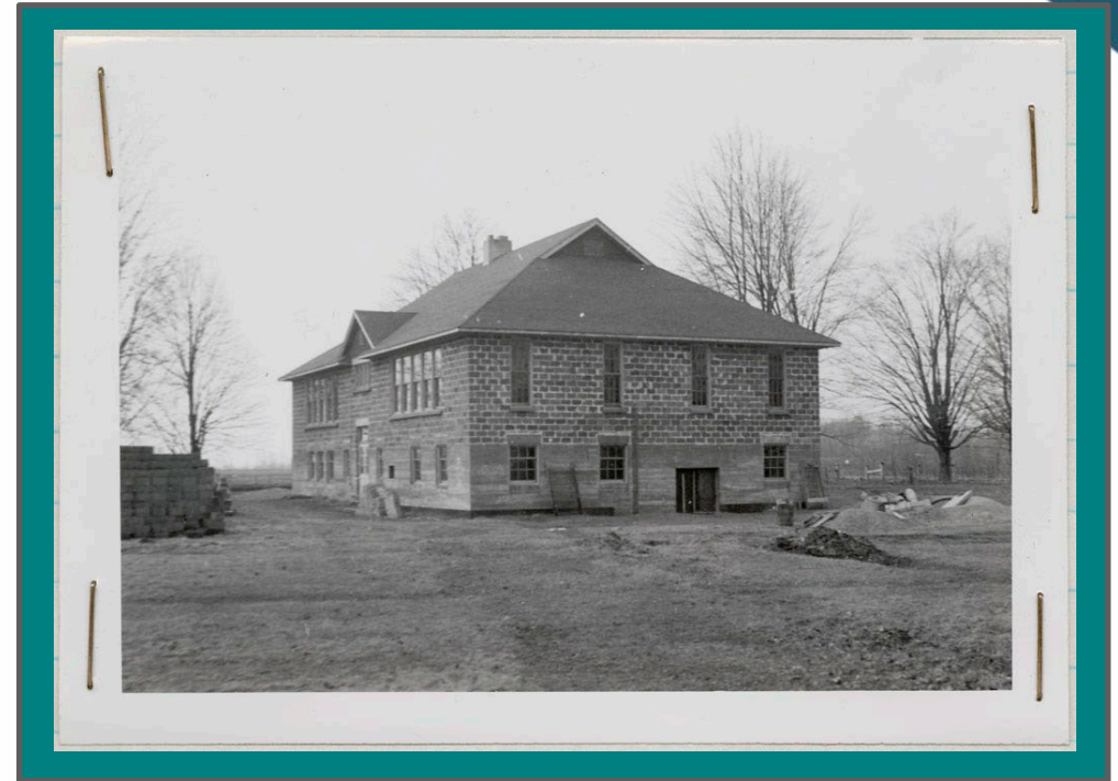
New Caradoc Day School, Mount Elgin, Ontario, 1948