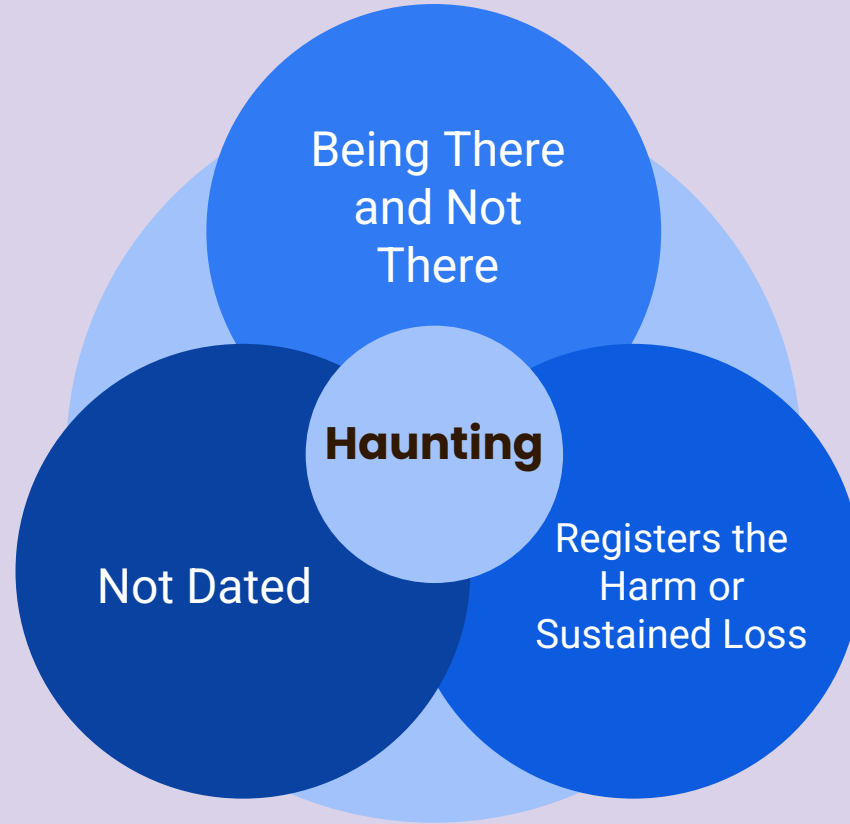
Visual Representation of Haunting