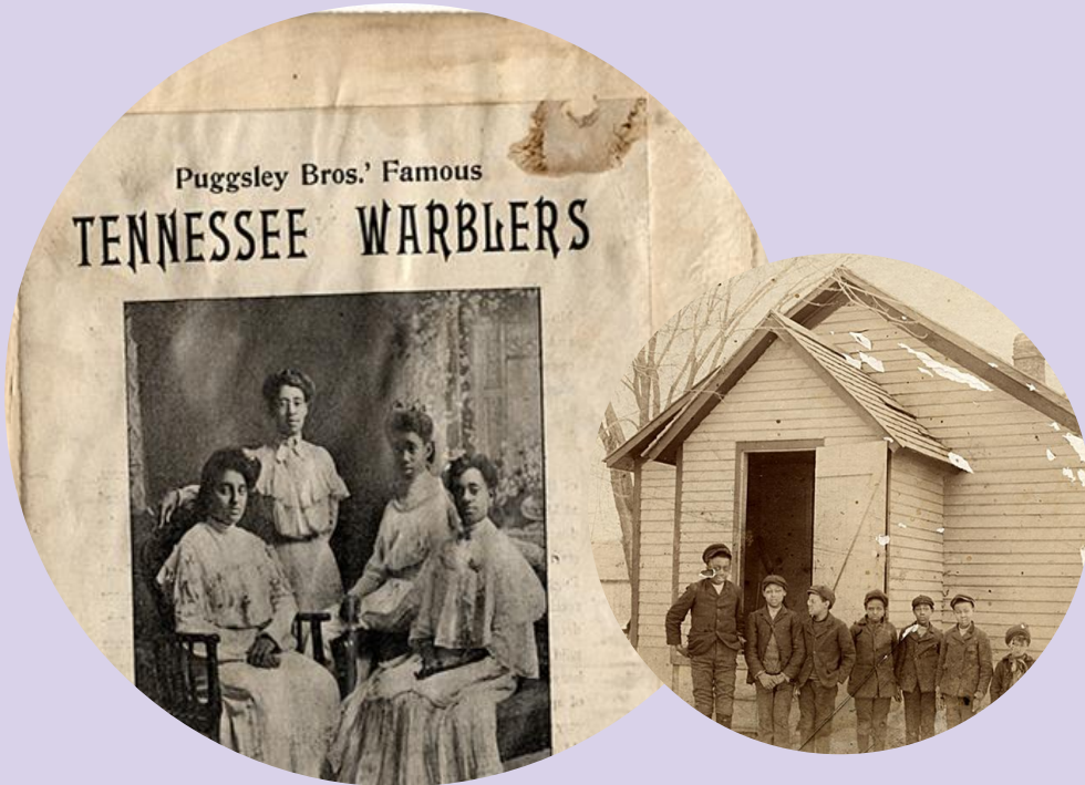
Images: Program for Puggsley Bros.' Famous, Tennessee Warblers, [ca. 1900] Children in front of the Marble Village Coloured School, [ca. 1900] Alvin D. McCurdy fonds, Archives of Ontario